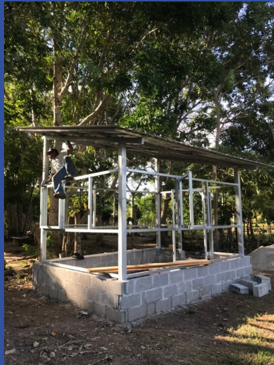
The place: El Río Chamelecón