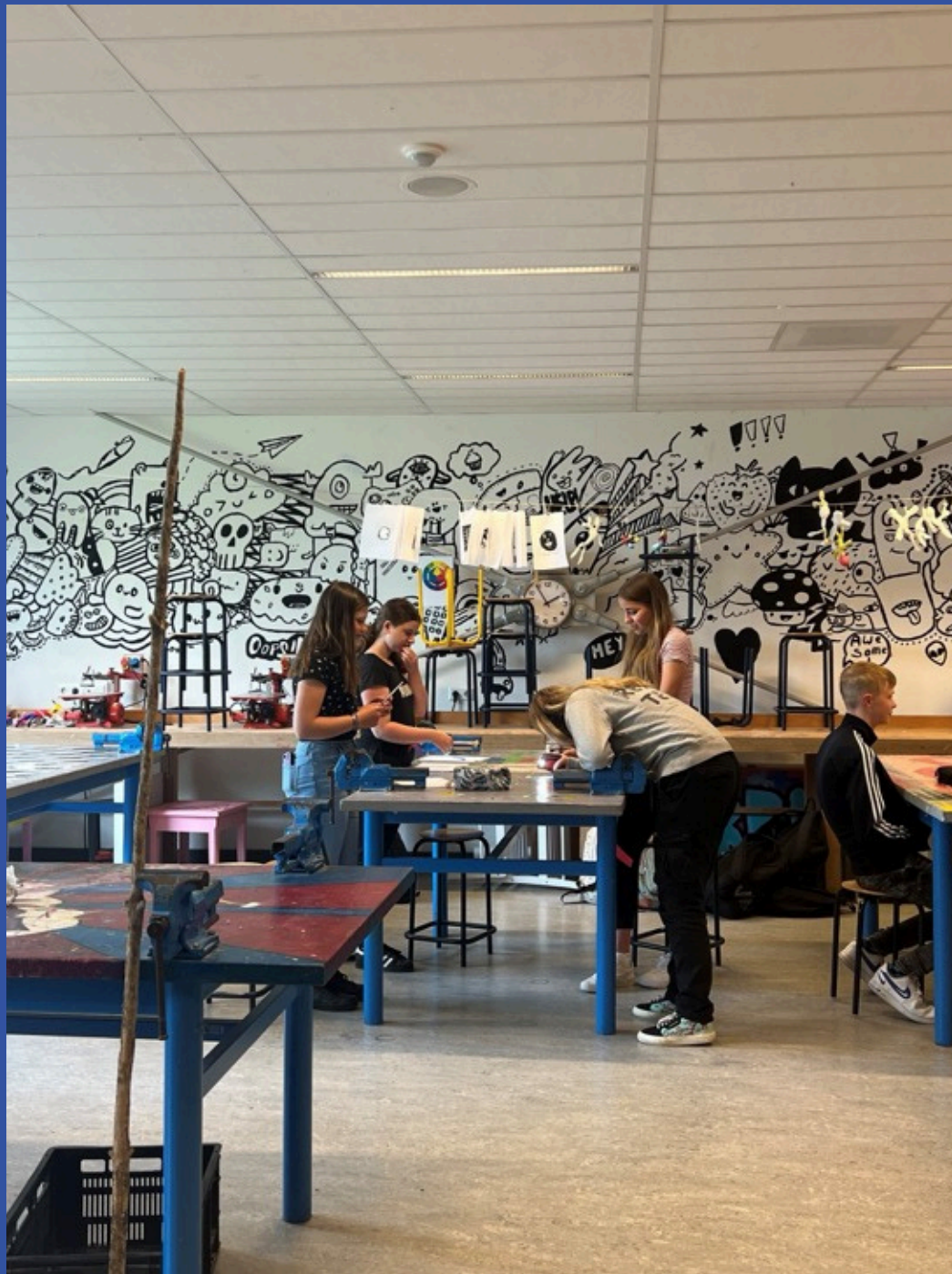
Workshop Series Part I – April 2022 – Uithuizen