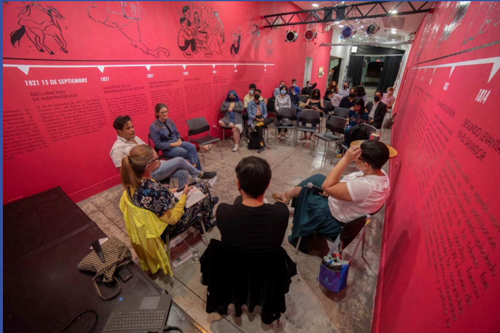
Panel Discussion in the Spanish Cultural Center, Tegucigalpa , Honduras– Aug 26th