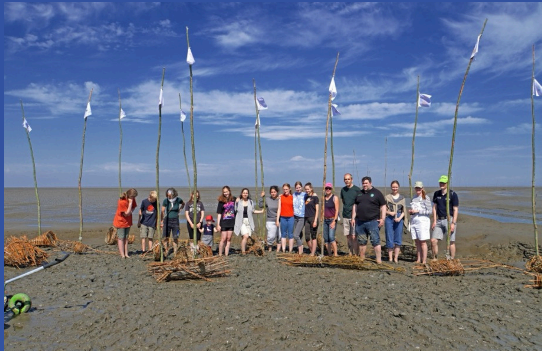
Workshop Series Part II - 3rd-4th July 2022 - Waddensea Dorum, National Park House Wurster Nordseeküste