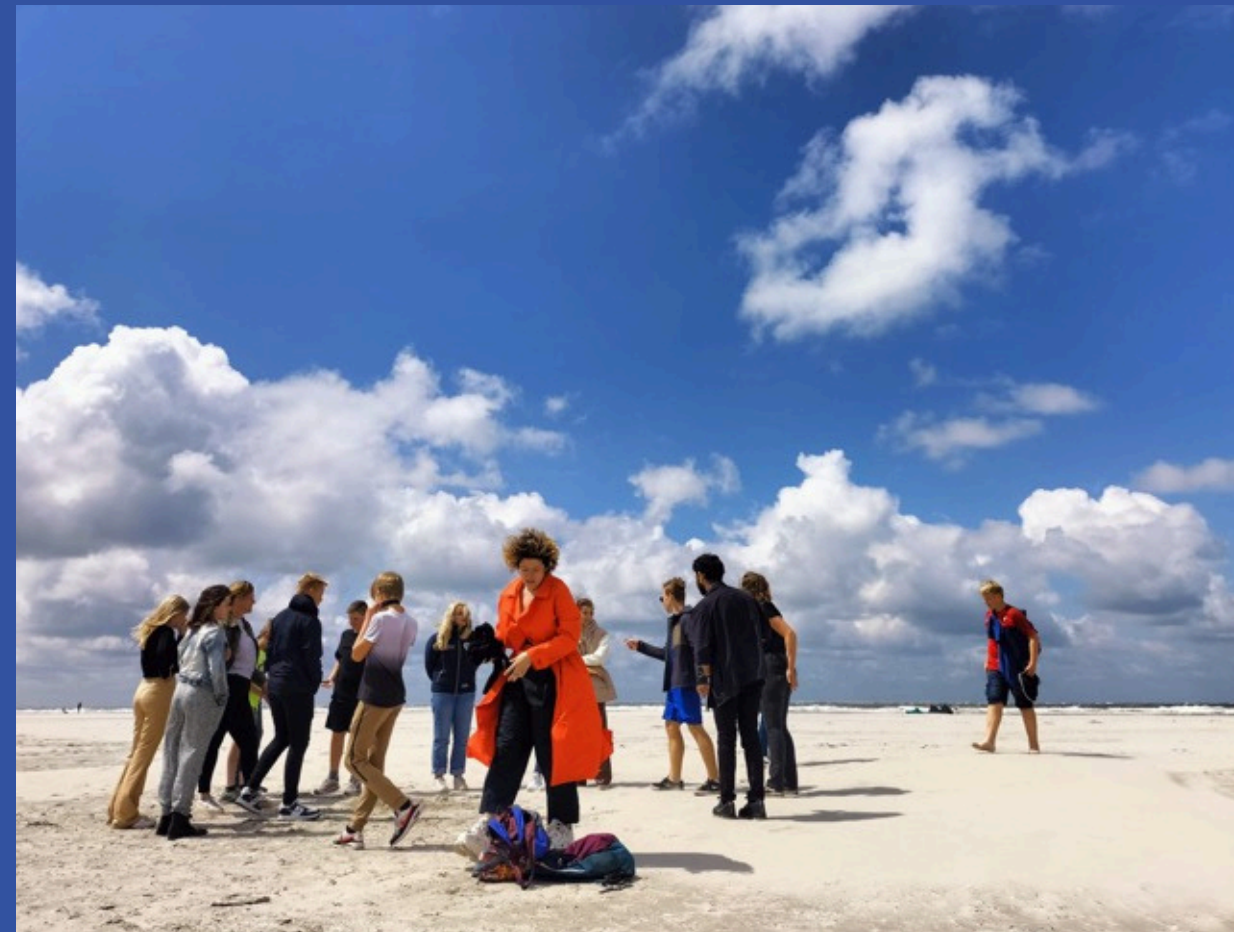
Workshop Series Part II – July 2022 – Schiermonnikoog